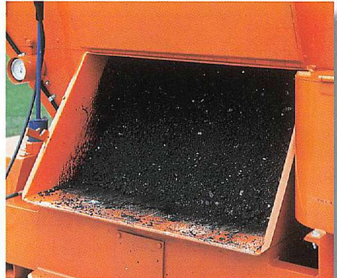
(Reclaimed Asphalt from above photo)