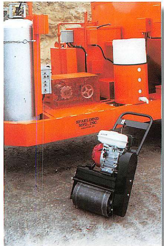
Bulldog 500 Vibratory Roller