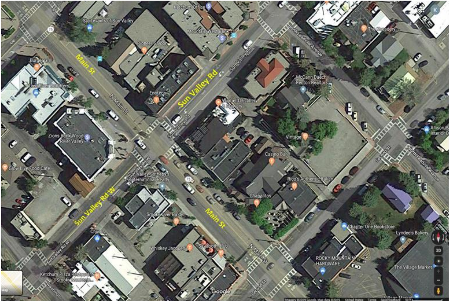
Photo for Action Item 3 Discussion with Joe Meek, ITD Traffic Engineer, about a PED Scramble at SV Rd & Main St