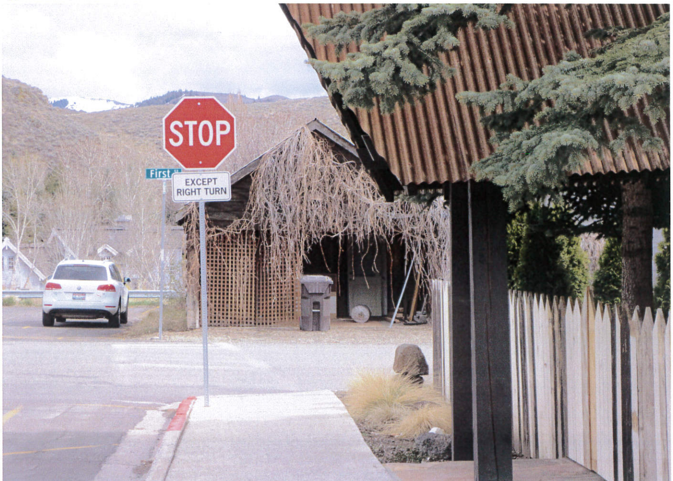
NORTH ELEVATION OF GARAGE FROM SIDEWALK IN ROW