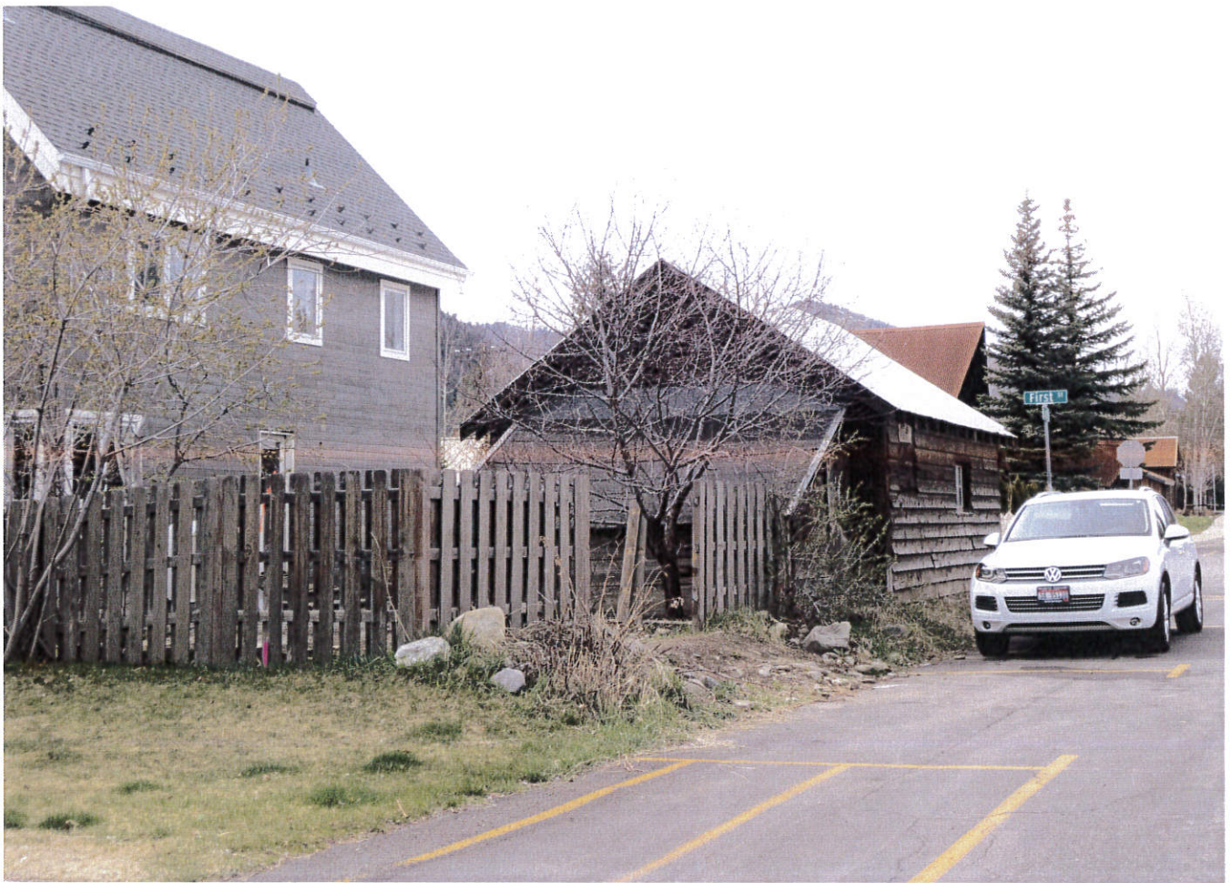
SOUTH SIDE OF GARAGE, LEAN-TO & FENCE. FROM EAST AVE.