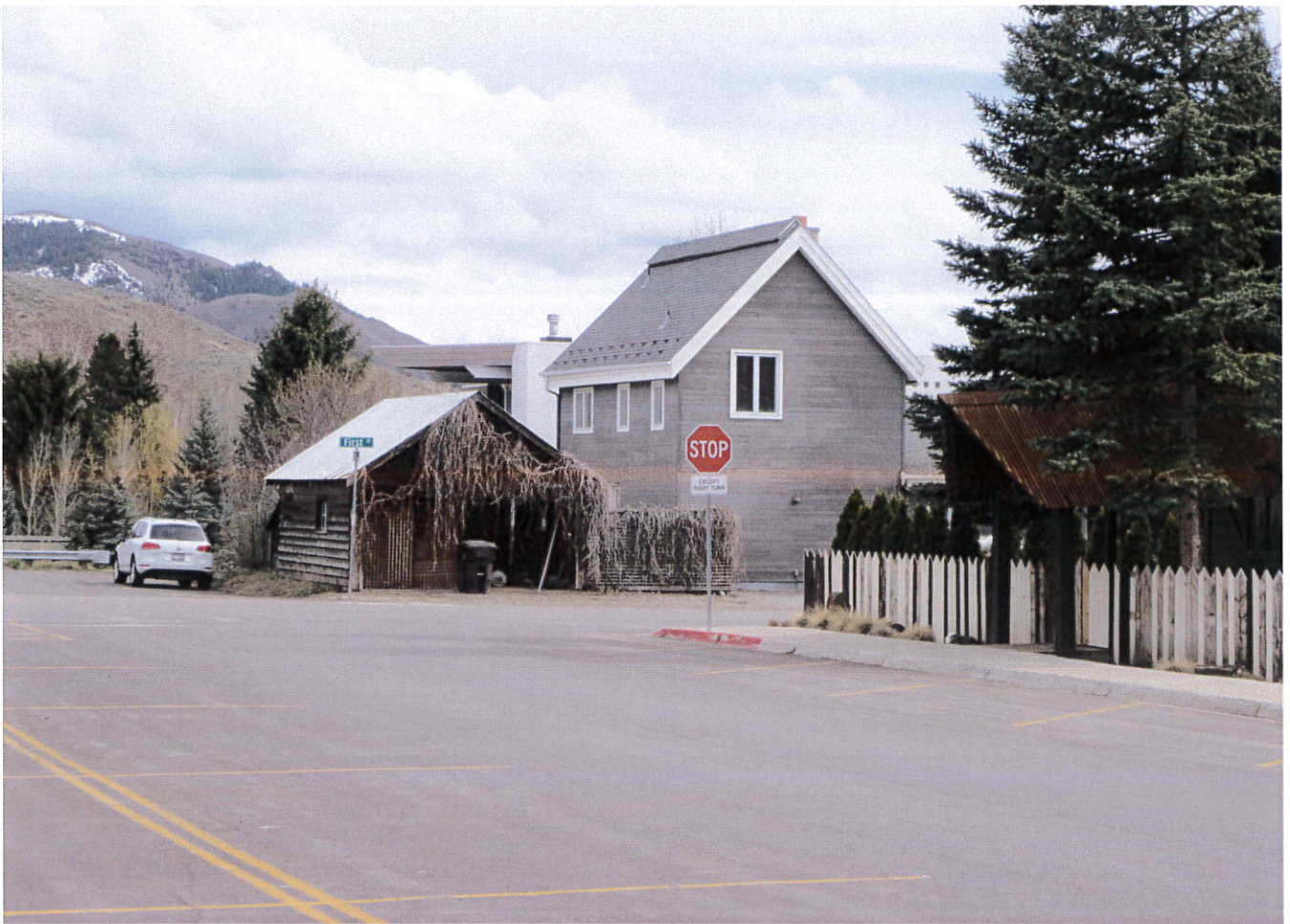
NORTH ELEVATION OF GARAGE FROM EAST AVENUE.